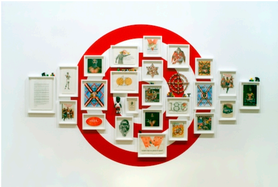
Tony Albert, Once upon a time... , 2014, mixed media on paper, installation (variable): 200 x 300 cm. Courtesy of the artist and Sullivan+Strumpf, Sydney.

by Art Guide Australia | Posted 25 Jul 2014