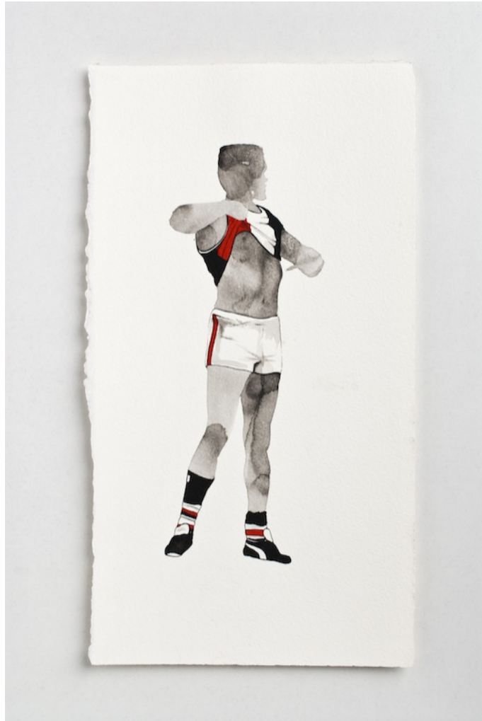
Tony Albert, Once upon a time... (detail), 2014, mixed media on paper, installation (variable): 200 x 300 cm.